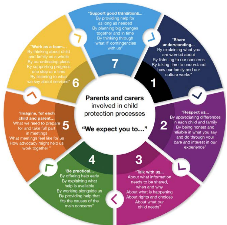
Expectations from parents who may be involved in child protection processes (National Child Protection Guidance, 2021)