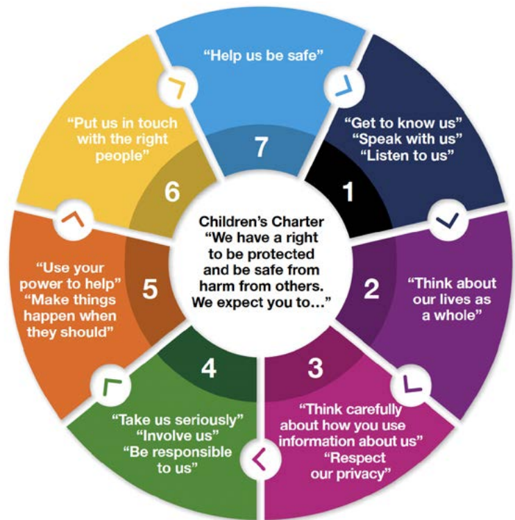
Expectations from children who may be involved in child protection processes (National Child Protection Guidance, 2021)